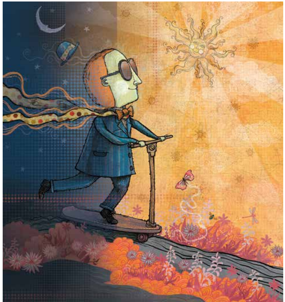
Illustration: Dennis Wunsch